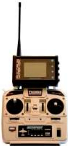
LCD Display Mounted on the Transmitter