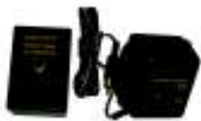
Navigator Power Supply & Charger

The Fulcrum Navigator is a satellite navigation system designed for baitboats of any manufacture*. as well as a number of other functions, it replaces physical marker buoys with an invisible electronic version. It can store and retrieve up to seventy five electronic markers which can then be used to guide your baitboat to a spot with high precision and ease - time and again, day or night on any water in the world.