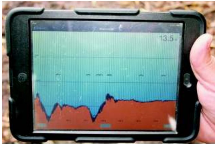
Bluesounder app running on an iPad mini (in a ruggedised enclosure)